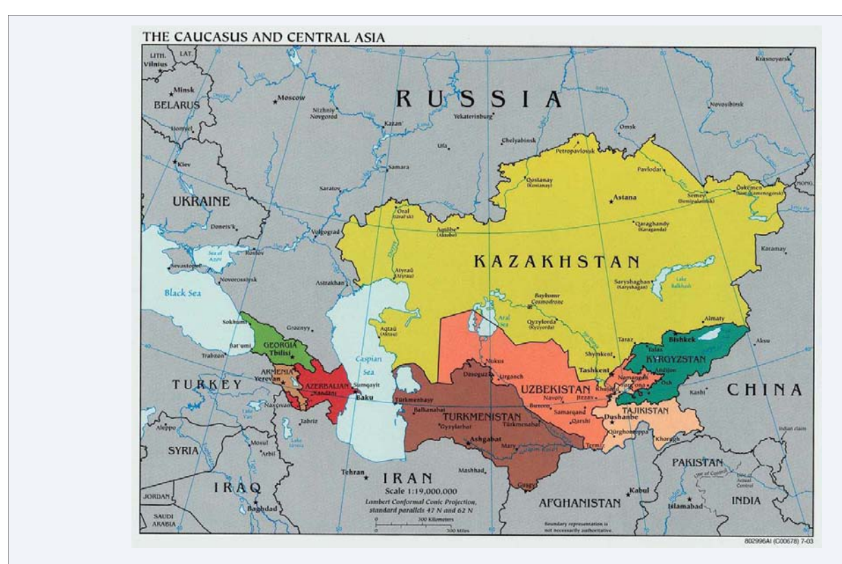
Figure 1 Map Central Asia.