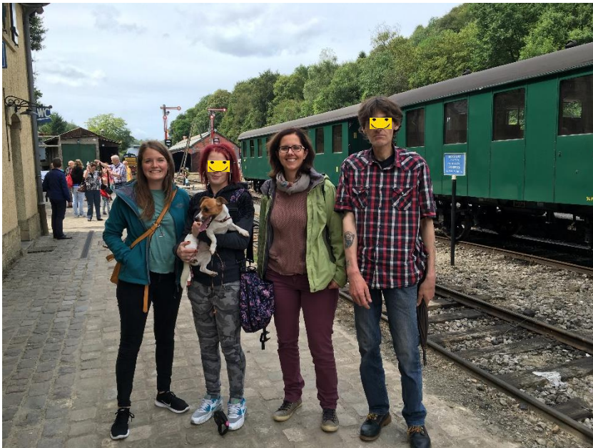
Fond de Gras