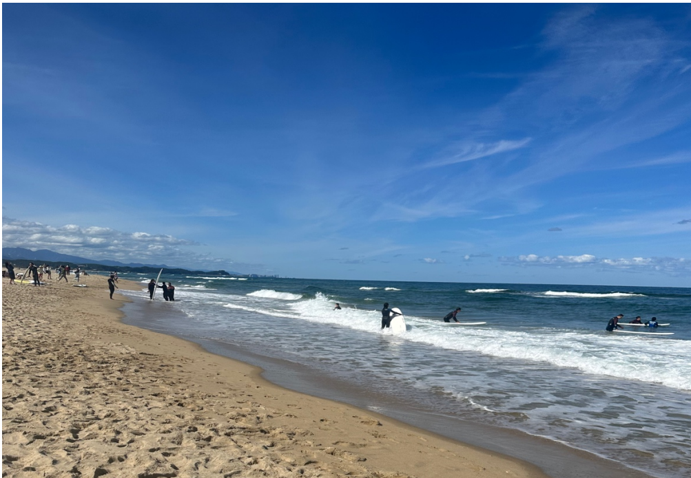
Thrilling surfing trip at Yangyang Beach, South Korea

South Korea won me over with its charming everyday conveniences. The fact that you can easily find self-serving photobooths, 24/7 open convenience stores, and delightful ice cream shops adds a touch of comfort to daily life. Exploring the city on my first evening was magical, the vibrant streets were alive with energy yet had a calming presence. What I truly loved about South Korea is the diverse range of activities it offers. For those who appreciate a good hike, the country's love for hiking is contagious. The trails are a perfect escape into nature. Even if you're just a leisurely walker, the well-designed streets make each stroll effortless and enjoyable. The city's blend of dynamic vitality and soothing ambiance creates a warm and inviting atmosphere that feels uniquely human.