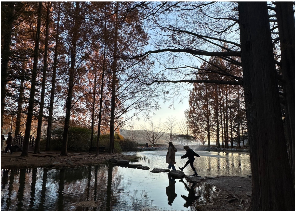
Breathtaking sunset in one of the famous spots in Andong-si city, South Korea

Looking back on my previous encounters, my venture as an exchange student at Konkuk University in South Korea commenced in the fall of 2023, marking the beginning of my 5th semester. As an International Business Administration student, this particular chapter occupies a unique and significant space in my academic journey.